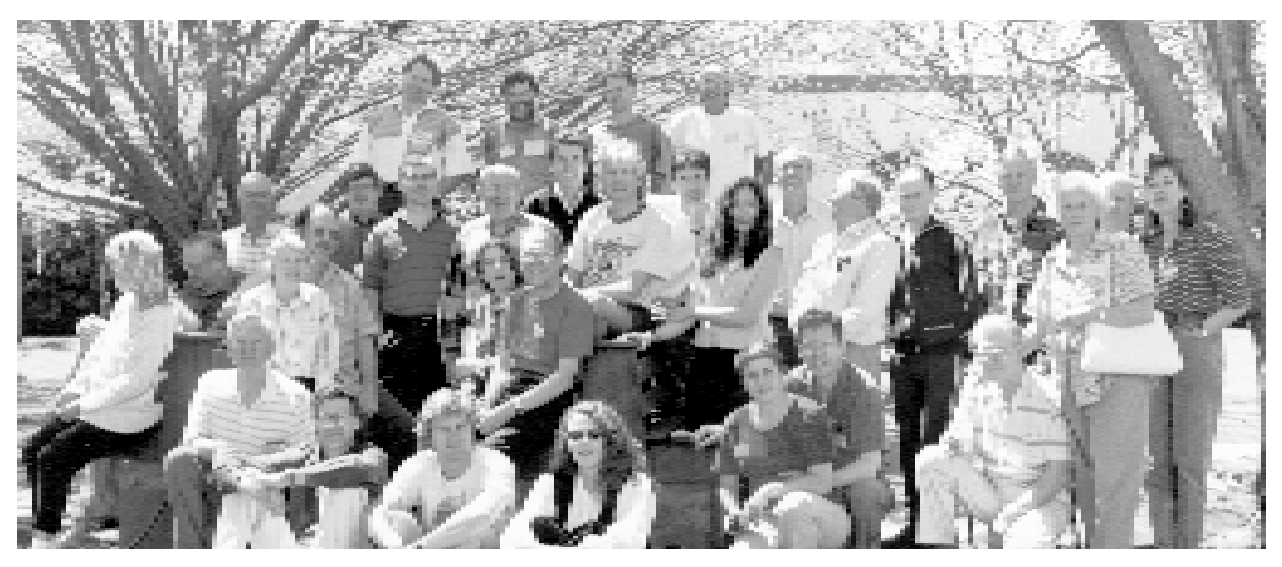
Common or garden variety readers, spotted at the 1996 URANTIA Book Readers Conference, Canberra, Australia (October 1996)

We of the Canberra Study Group endeavoured to provoke thought and discussion in presenting the theme of "Evolution", hoping those present would come away from the conference mentally challenged and spiritually uplifted, inspired to go out and do something.