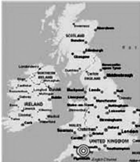
Paignton, Torbay, Devon, England (the Southern coast of England between Exeter and Plymouth)

that includes dinner bed & full English breakfast and this can be booked by contacting the hotel reception and quote IUAUK&I on +(44) 01-803526397 and the hotel facilities can be viewed on www.redcliffehotel.co.uk