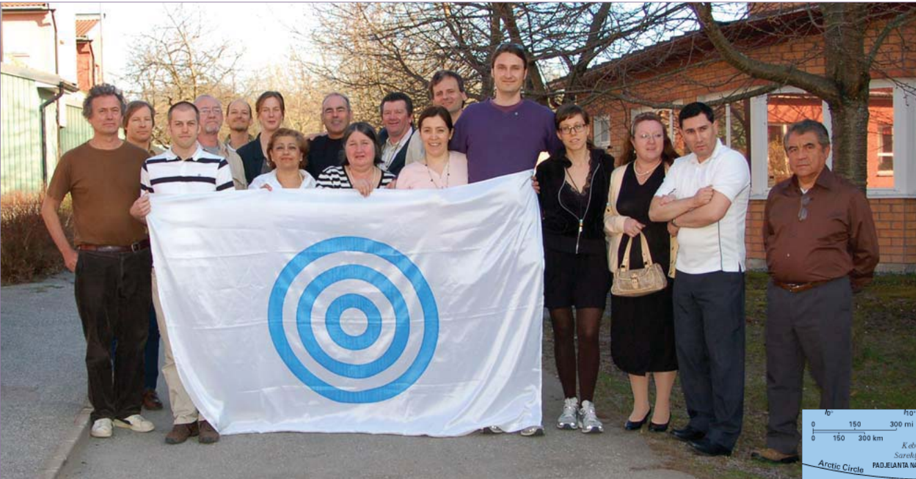
Group photo. More pictures of inauguration at http://www.urantia-uai.org/photos/index.html