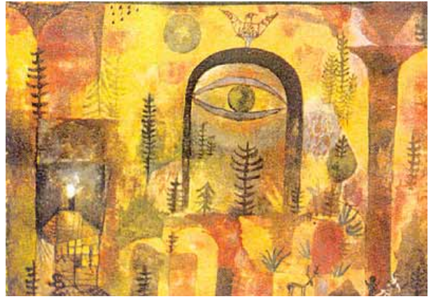
"With the Eagle" Paul Klee, 1918