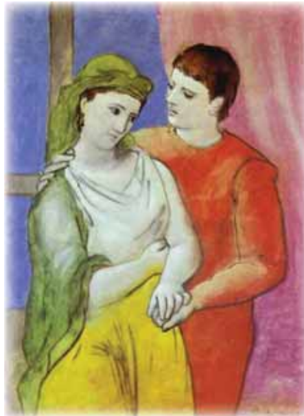
"The Lovers" Pablo Picasso, 1923

The Father's love follows us now and throughout the endless circle of the eternal ages. As you ponder the loving nature of God, there is only one reasonable and natural personality reaction thereto: You will increasingly love your Maker; you will yield to God an affection analogous to that given by a child to an earthly parent; for, as a father, a real father, a true father, loves his children, so the Universal Father loves and forever seeks the welfare of his created sons and daughters. [40:1]