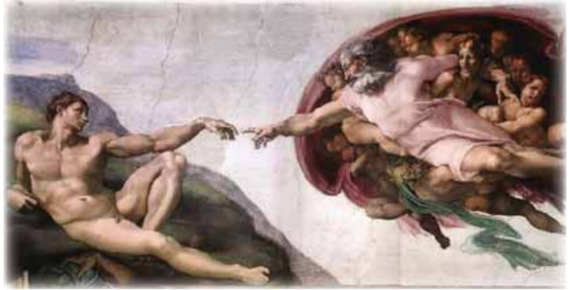
"Creation of Adam" Fresco by Michelangelo Buonarroti, 1510