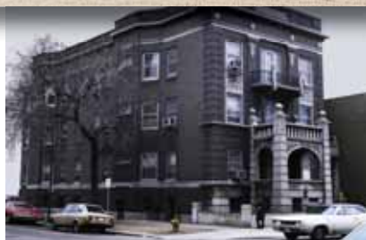
Urantia Foundation, 533 Diversey, Chicago