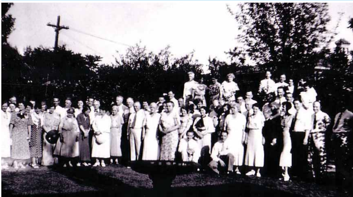
SUMMER PICNIC. A group of participants during the early Forum years at Beverly Shores, Indiana, mid-1930's.