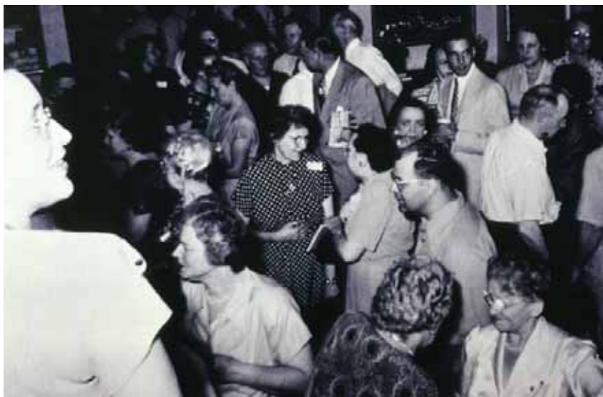
Forum party 1930's