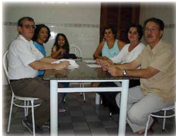
Jundiaí study group