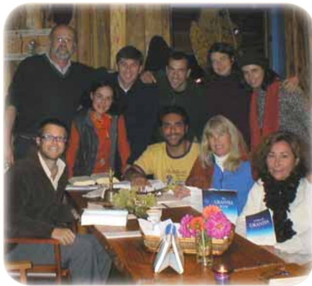
Puerto Varas study group, April 2005

This is a huge, beautiful old train station which has been converted to an exposition hall. I stayed with the cousin of a Chilean friend of mine who I was also able to