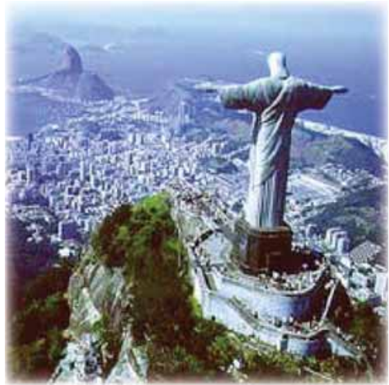
Statue of Christ over Rio de Janeiro

The amazing Spanish author, J.J. Benitez, has much to do with the existing situation. His fiction novels are all translated and sold in Portuguese. He has revealed to his large readership that the source of many of his stories is from "The Fundación Urantia." The Spanish-speaking source seekers had El Libro de Urantia available and waiting for them... note the Foundation's records of how the Spanish edition had recently been outselling the English one. What Brazil, Portugal, and her handful of colonies