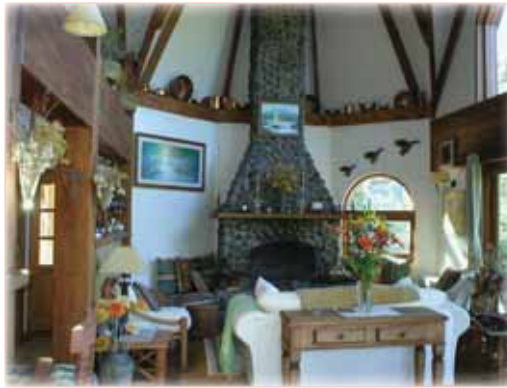
Fireplace study group setting