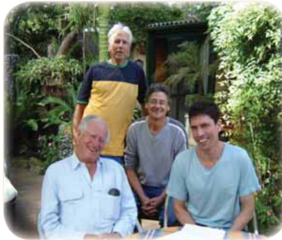
A small Aussie team B

We hope students of The Urantia Book will start making plans for an exciting and unique trip to the great land “down under”.