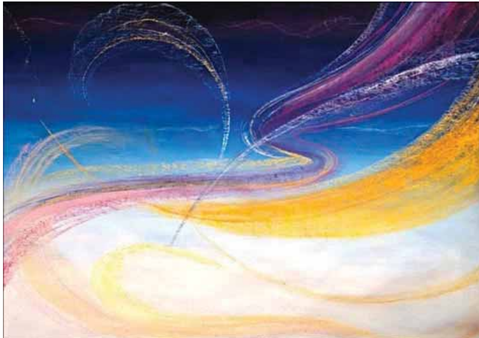
“Recent № 19” © Carol Cannon