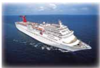
Sail to Cozumel, Mexico from New Orleans, Louisiana

http://www.carnival.com/Ship_Detail.aspx?shipCode=SE