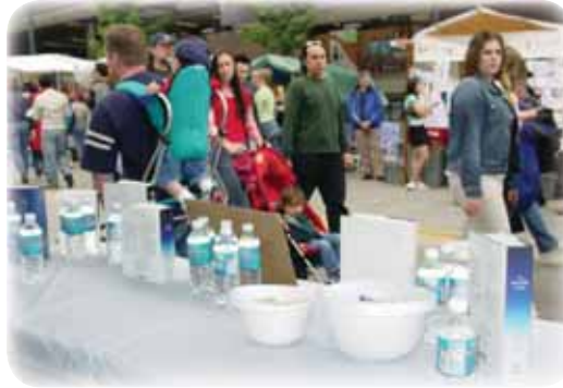
Street fair at the U District

Some people would ask questions but because we were so busy selling water we really could not strive after them, we could only answer their questions quickly. Many times I told them a page and paragraph that might answer their questions, which immediately would plant their nose between the pages. One young fellow stopped by with his girlfriend and as he excitedly turned the pages, looked over at his girlfriend and said, “Do you see what this is, this is incredible, I’ve got to have this book.” A young woman stopped and said, “I have this book, my father’s really into it, I guess I should try again to read it.” At one point three young men flanked the front of our booth with the demeanor of skepticism, and asked a question, “What is this?” So I told them to open to the first page of the Forward and read the first paragraph and the last paragraph and if that did not grab them, there was nothing more that I can say that would. So they stood