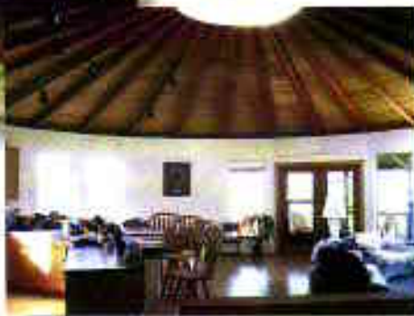
The Great Room