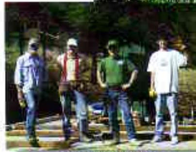
Boiler Work Crew