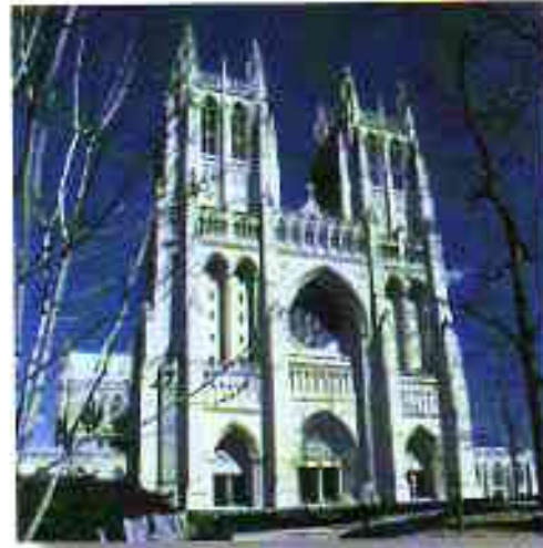
National Cathedral, Washington D.C.

He has a chapter on bells, which I found particularly meaningful. "Bells are