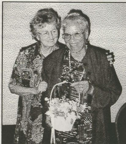
They look like 2 sisters... Don't they?