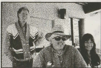
Happy about the trip? You bet!