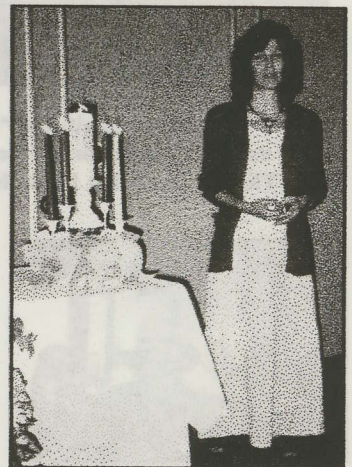
Rosie: "I just love you, guys!"