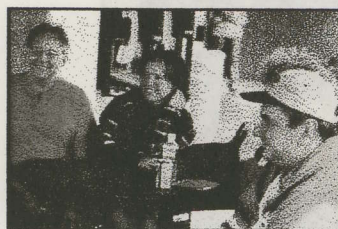
Other "Happy Caverners"...