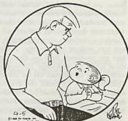
THE FAMILY CIRCUS BY Bill Keane

"When people get to heaven, are they allowed to hug God?"