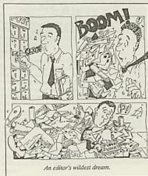
An editor's wildest dream.

Those of you who think that you hear voices or are channels to the spirit world should remember that the Book specifically warns you that it would better to reject information that you supposedly receive via your Adjuster than to blunder into exalting what is really a reaction of your own mind to the status of divine dignity (see 1208). At the present stage of development of Urantia mortals, only rarely will any of you be conscious of that auto-revelation which is an ongoing and continuous process occurring in your superconscious minds. But I am only your friendly computer. You have The URANTIA Book with which to do your own research and make your own decisions. Bye for now and God bless.