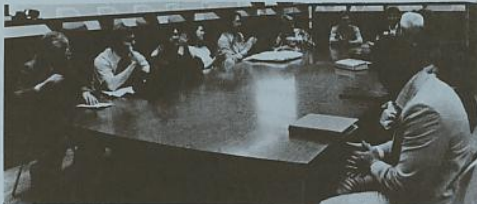
Why are these people clapping? Find out on page 3.