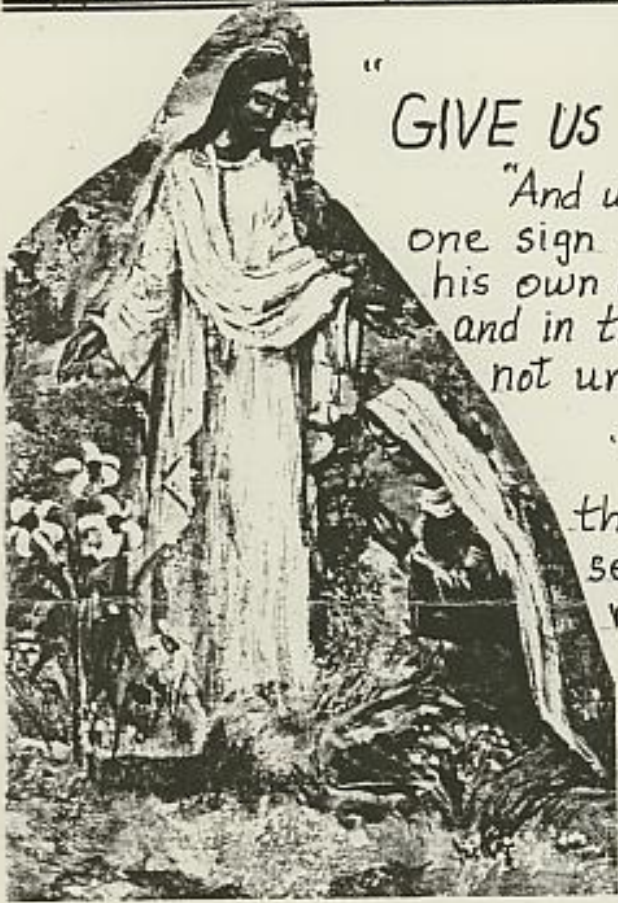
He is Risen

All quotations, unless otherwise indicated, are from The URANTIA Book c 1955 and are used by permission. Interpretations and opinions herein are those of the authors.