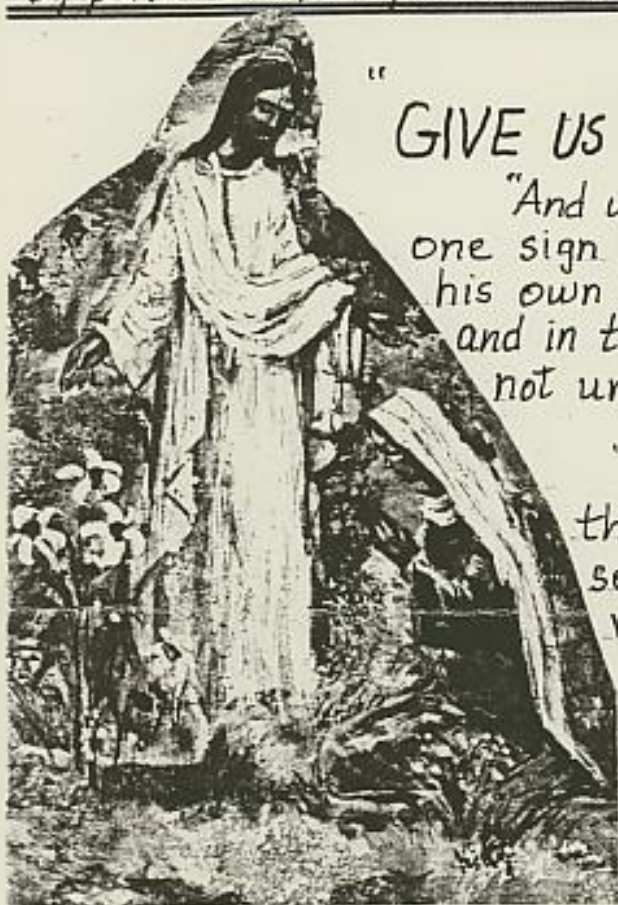
He is Risen

All quotations, unless otherwise indicated, are from The URANTIA Book c 1955 and are used by permission. Interpretations and opinions herein are those of the authors.