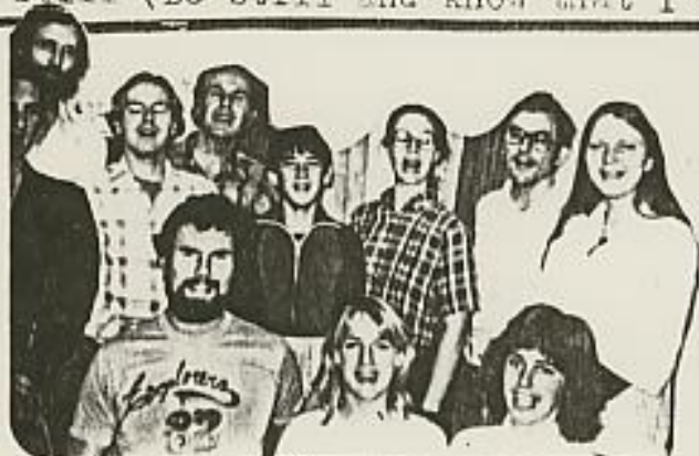
Harp Singers (do re mi fa sol la si do)

5. I have time for meditation and relaxation. Long held intellectual beliefs may suddenly "flash into my imagination" -- become truth. A person once came upon me sitting in a rocking chair in a room by myself, absolutely still. "What are you doing?" "Nothing" "You're crazy" -- "On the contrary, you're the crazy one if you can't be still" (Be still and know that I am God).