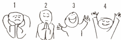
(1) Problem, (2) Prayer, (3) Provision, (4) Praise

The first P is any Problem we face, physical, financial, emotional, mental or spiritual. The second P is our Prayer response. How often do we forget to meet problems with prayer? Is not prayer the infallible tool for coping with every problem? We should make this prayer response to problems so habitual as to be automatic. God will inevitably provide a solution to our problems. This is the third P, God's Provision of a solution. At this point we should remember again to respond spiritually, this time with the fourth P, which is Praise . To complete the circle, we must go beyond mere relief or satisfaction when the problem is solved, we should also thank and Praise God for his Providence.