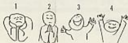
(1) Problem, (2) Prayer, (3) Provision, (4) Praise

The first P is any Problem we face, physical, financial, emotional, mental or spiritual. The second P is our Prayer response. How often do we forget to meet problems with prayer? Is not prayer the infallible tool for coping with every problem? We should make this prayer response to problems so habitual as to be automatic. God will inevitably provide a solution to our problems. This is the third P, God's Provision of a solution. At this point we should remember again to respond spiritually, this time with the fourth P, which is Praise . To complete the circle, we must go beyond mere relief or satisfaction when the problem is solved, we should also thank and Praise God for his Providence.