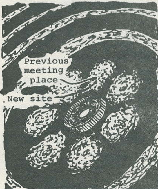
The Big Picture: (See maps to right for more detailed directions.)