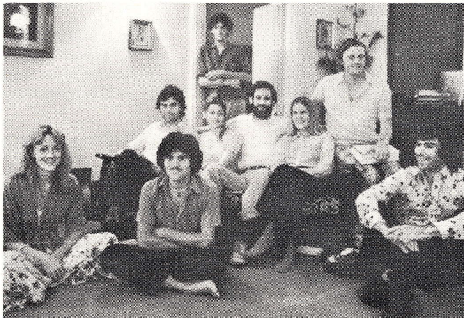
The Bacon's Study Group