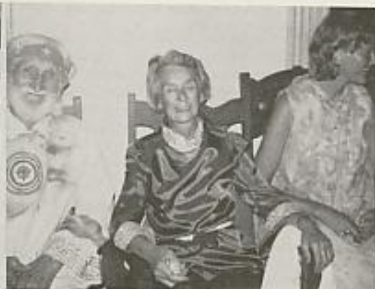
Some of the children at Universal Brotherhood

Informal gathering at Universal Brotherhood