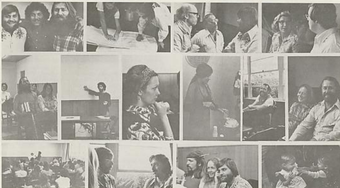
Photos taken at recent FUSLA meetings.