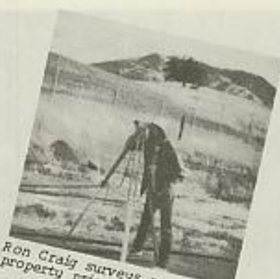
Ron Craig surveys part of the property prior to landscaping.