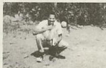
A broadcast listener in Dominica (see below).