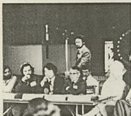
Representatives from the world's living religions discuss ideals and beliefs during a recent Spiritual Renaissance Conference.

The 10th Annual Spiritual Renaissance Conference will be held on May 26 and 27 at the Pacific School of Religion in Berkeley. Details of the conference are being worked out and more information will be reported in the next issue of the UPDATE. Everyone is invited to attend this weekend of exploring the unity of ideals held by the world's 11 great living religions.