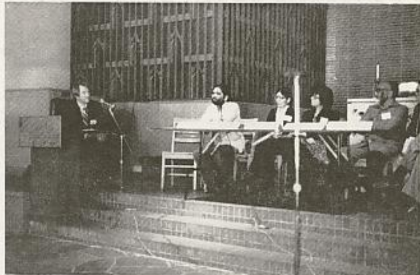
Scenes from past Spiritual Renaissance Conferences.