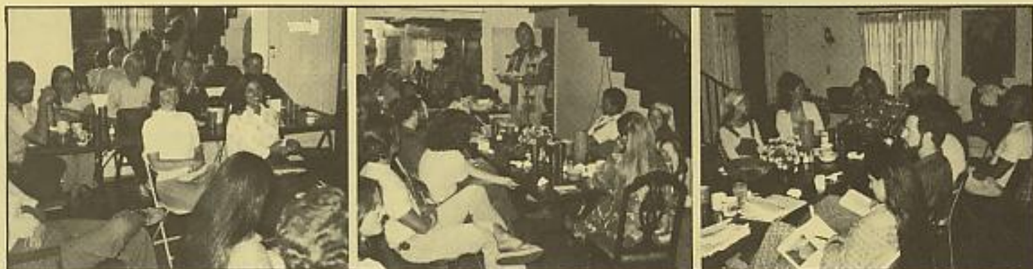
Every Monday evening we have a meal and meeting together to keep up-to-date on plans and developments.