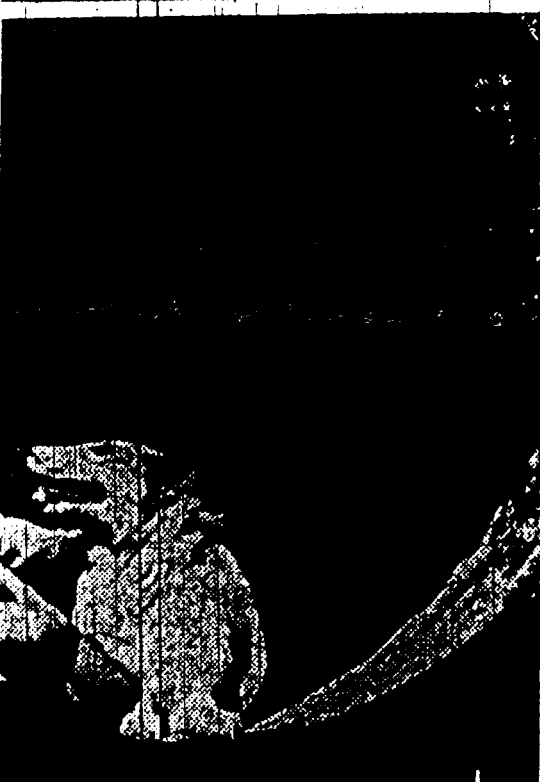
ular mouth of a culvert, this picture by renzo, Cal., won the $100 third prize in oto contest.