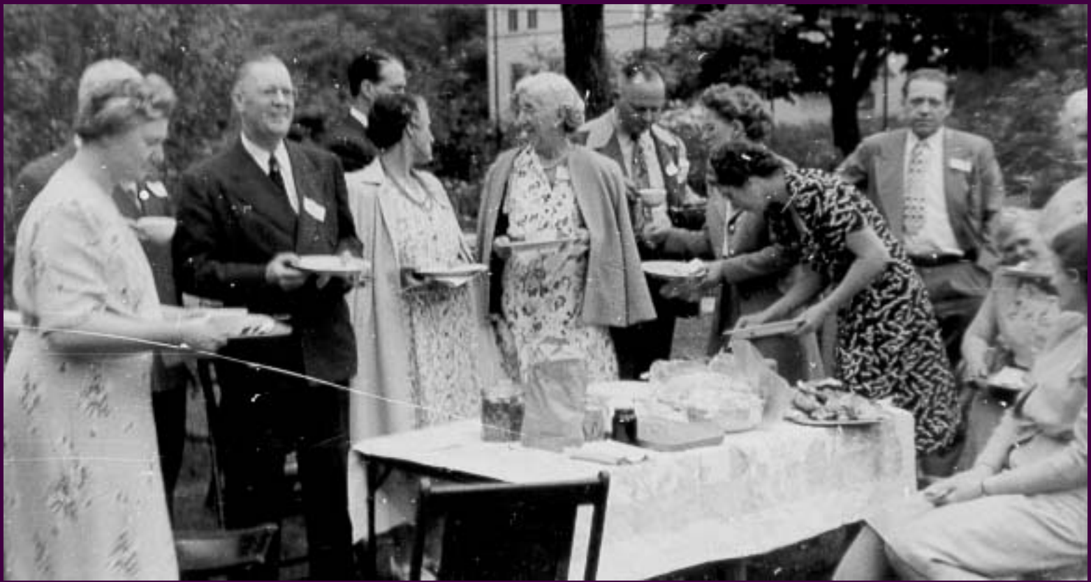
Forum Picnic, June 21, 1947