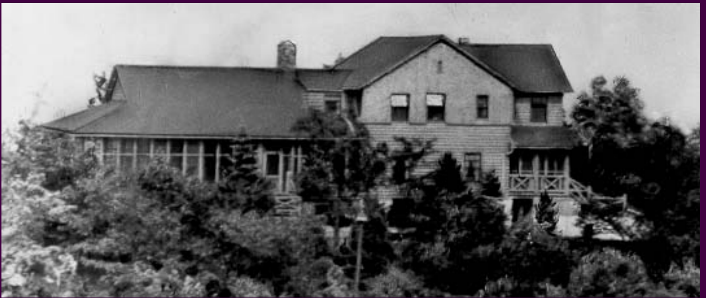
Pine Lodge, September 1947 Forum retreat location at Beverly Shores, Indiana