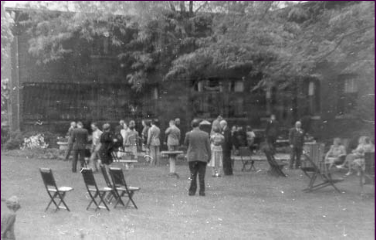
Forum Picnic in the Hales' back yard, June 21, 1947