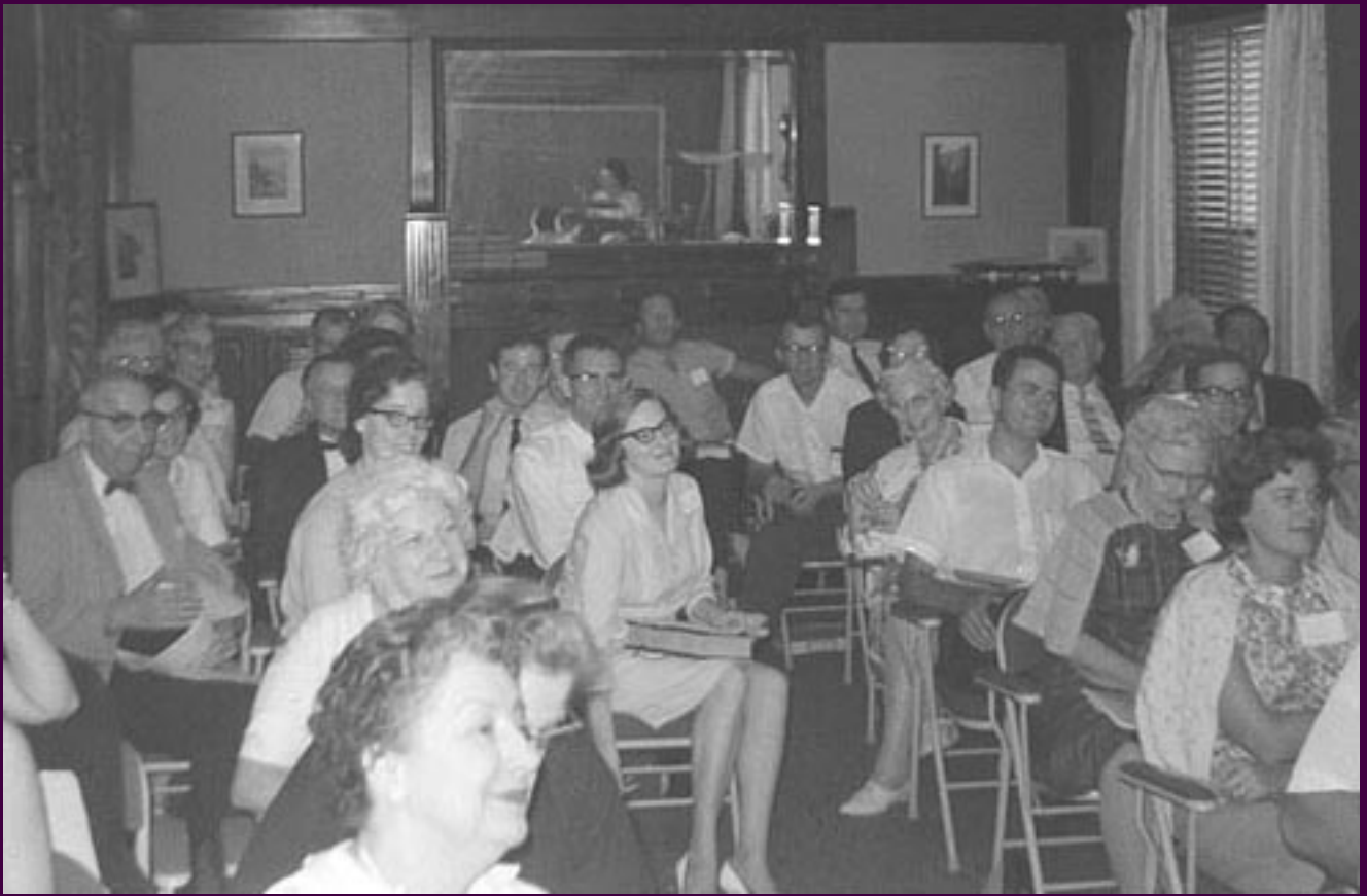
Summer Seminar at 533, August 7, 1965