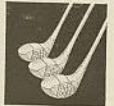
A SET O'THREE, Vulcan's Matched Woods—Driver, Brassie and Spoon. In the Thorobred Model.

Ask your Dealer or Pro to show you the Stainless Set, and a Set O'Three V-20's. If he is not yet supplied, send his name and ask for Vulcan's attractive 1928 catalog shown to the left.