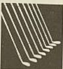
The STAINLESS SET by Vulcan. Perfectly Matched, but different—Matched after famous Scotch hand-made irons.

R ARE wood, gleaming metal, ivory, and tempered steel . . . faultless modeling . . . beautiful finish. These are marks of quality, but the real Vulcan character is not a superficial thing. The enthusiasm of the artist-craftsman so evident on the surface goes clear through. Get the feel of these fine clubs! . . . then you'll know they are the thorobreds they seem.