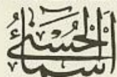
The Beautiful Names