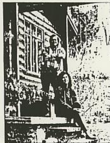
"I have read The Urantia Book so much that I only wish to tell you the world."

"If Adam and Eve had only survived, then would you have had music in reality, but the physical harmony, so large in the masses, has been nullified by strains of anomalous tendencies that only once in a thousand mortal lives is there any great appreciation of harmony. Do not be discouraged; some day a real musician may appear on Urantia, and whole peoples will be enthralled by the magnificent strains of his melody. The such human beings could however change