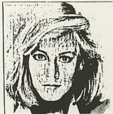
"When I was the observer, The Urantia Book made me love the lives of the people who read it. That is how I read the book for myself."

A careful reading of The Urantia Book will reveal an intellectually challenging, loving presentation of powerful ideas crafted in some of the most elegant yet straightforward prose found anywhere in the English language. Readers of The Urantia Book around the world often experience a profound joy that comes from a new and new perspective on our place in the family of the cosmos. The Urantia