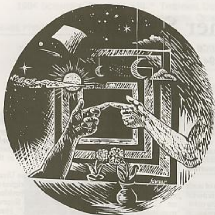
"The Mirror -- When will we be responsible for what we create?"