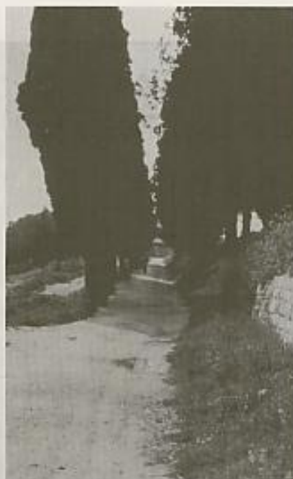
Walk the roads of Nazareth, where Jesus spent his childhood years.