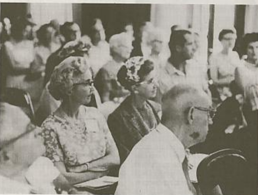
The first summer study session, held in August 1963, was largely attended by Chicago residents.

Our ideals encourage us to think of our work as having international significance. We do not believe it should be restricted to any one people or culture. Nevertheless, the experiential actualization of such ideals requires a degree of cultural readjustment which is more welcome in theory than in fact. It is not easy to change old habits, or old ways of doing things. So far, the work of the Fellowship has favored the preferences and tastes of Americans.