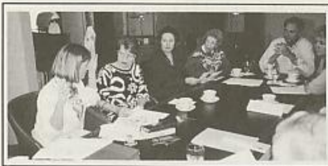
Bottom left: Houston Society hosted the International Fellowship Committee at its recent meeting in Houston.