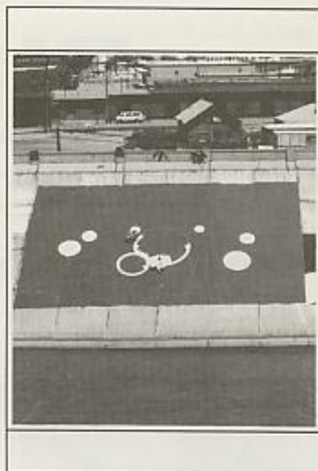
Right: A mural of the worlds of Jerusalem being painted on the levee in Pueblo, Colorado