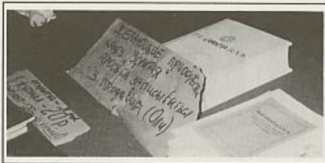
Top left: The Urantia Book was displayed with other texts at the Urantia Conference held recently in Moscow.