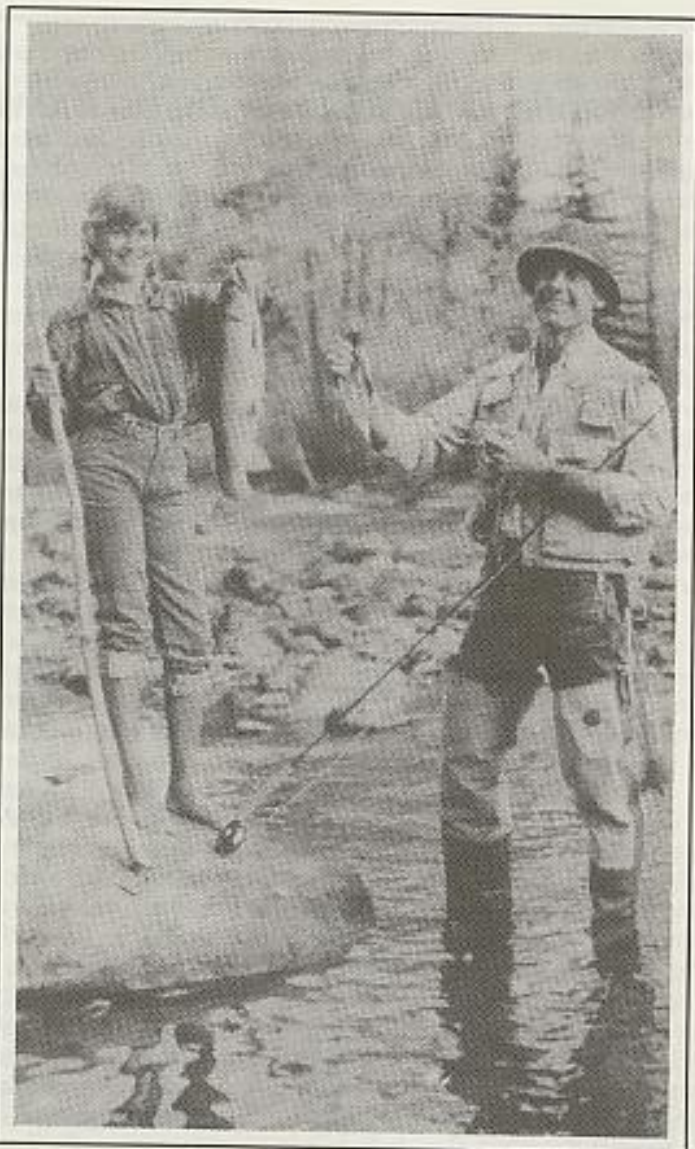
"Cast a line in a rushing trout stream."

So, why take the family to Snowmass this summer? Come and find out!