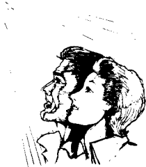
A MAJESTIC VIEW

The spiritual concepts of The URANTIA Book occur in many other places in bits and pieces. What it offers is the manner in which these concepts are filtered out and fitted together into a majestic view of God's relationship with man — who we are, why we are here and how we may continue our journey Godward. In no other writing are such teachings set forth so as to give such a sense of the intellectual, philosophical and spiritual unity of God's dealings with man in the realms of matter, mind and spirit.