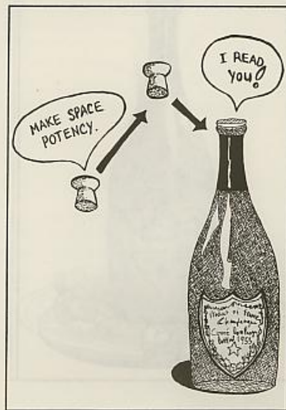
Appearance of the second cork. The Universal Absolute. The Qualified and Un-Qualified Absolute can now do business.