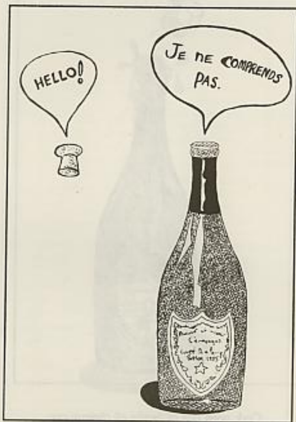
Qualified Absolute attempts communication with the Unqualified Absolute ; No response, incomprehensible.