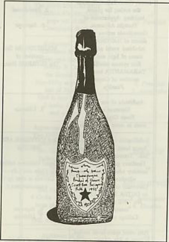
Champagne bottle with cork wired ....signifies the I AM The Unqualified Absolute